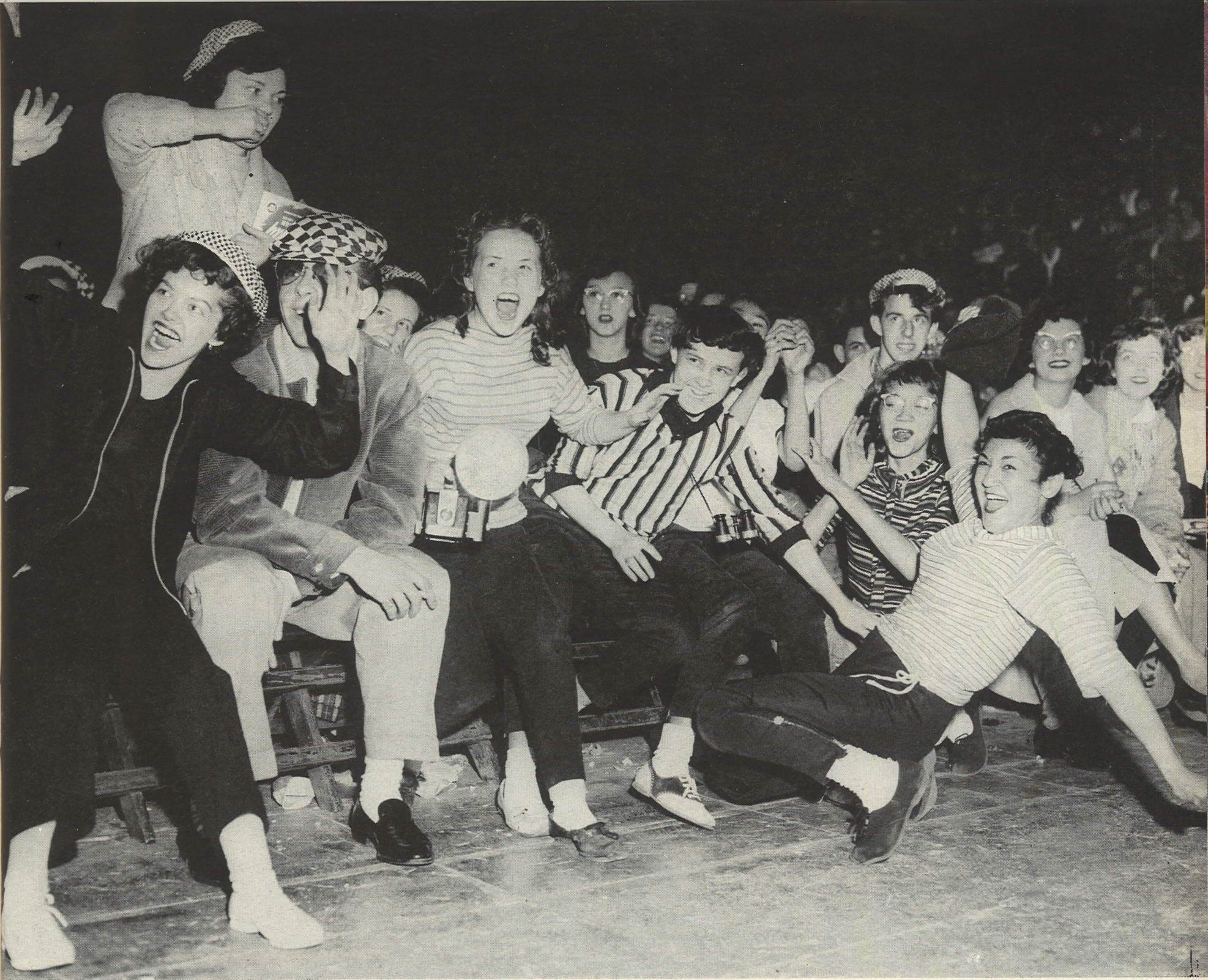
ENRAPPED BY THE ROCK 'N' ROLL RHYTHM, TEEN-AGERS IN CHICAGO STADIUM WHOOP IT UP DURING THE RALLY. THEY STAYED EXCITED BUT WELL-BEHAVED