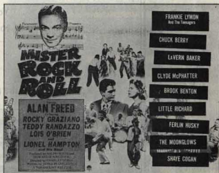
22 x 28 LOBBY PHOTO "B"

Also Available SET OF EIGHT 11x14 LOBBIES 14x36 INSERT CARD WINDOW CARD • TRAILER