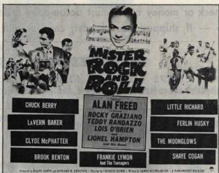
22 x 28 LOBBY PHOTO "A"

ORDER ALL ACCESSORIES FROM NATIONAL SCREEN SERVICE