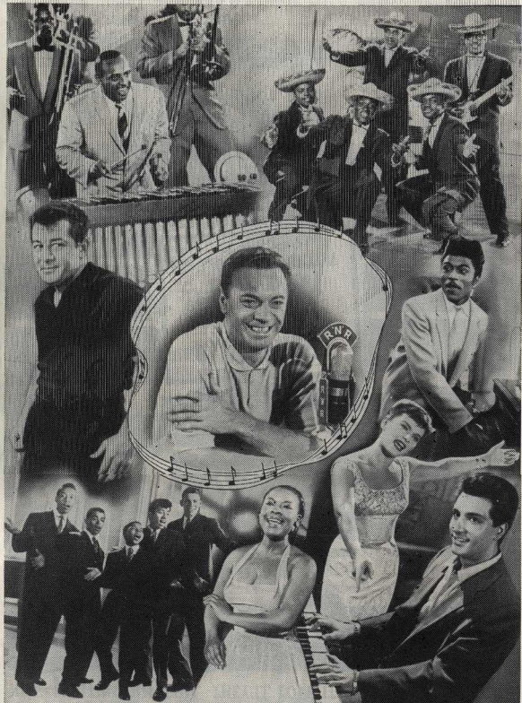
Still No. RAR-7A