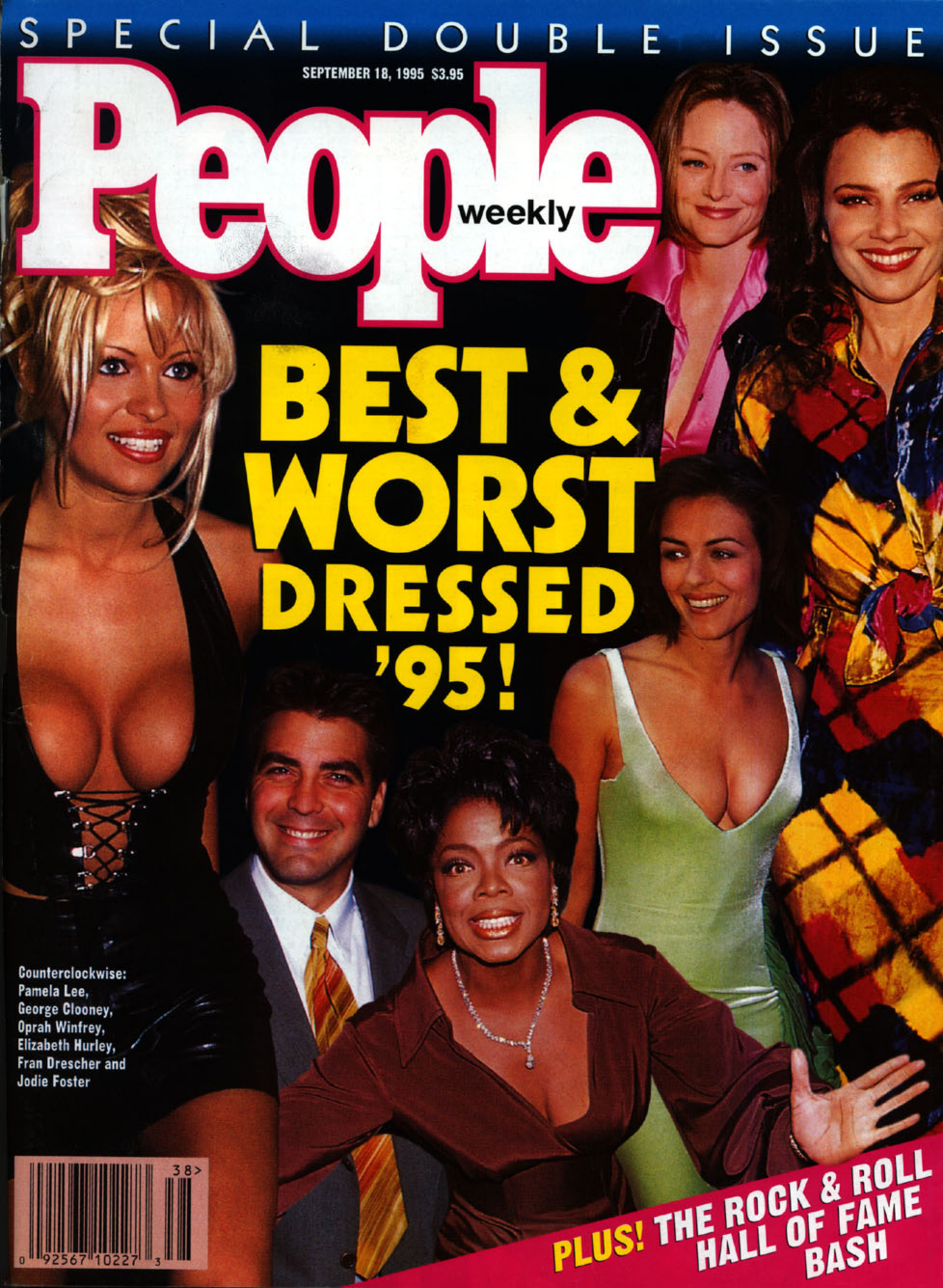
Counterclockwise: Pamela Lee, George Clooney, Oprah Winfrey, Elizabeth Hurley, Fran Drescher and Jodie Foster