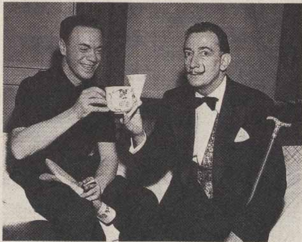
ALAN FREED (LEFT) AND SALVADOR DALÍ

Warwick Hotel, New York City, February 22nd, 1957