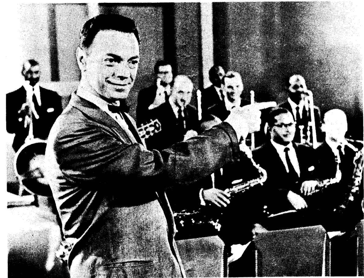
ALAN FREED THE KING OF ROCK'N'ROLL HIMSELF!