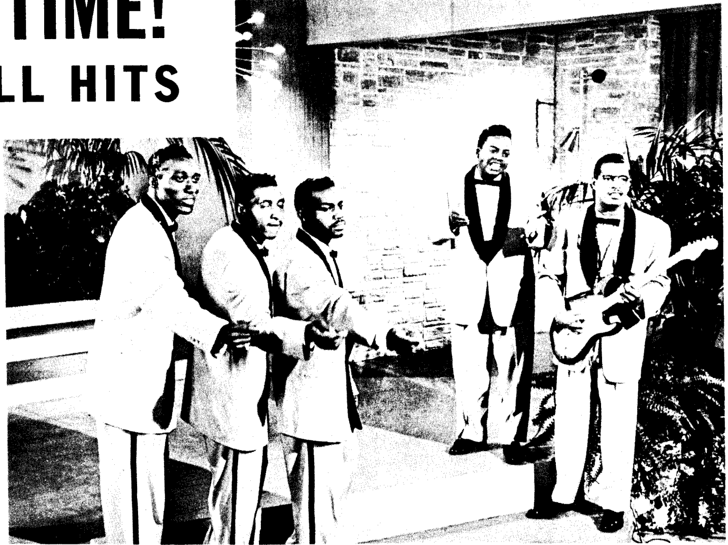
THE MOONGLOWS OF "SINCERELY" FAME