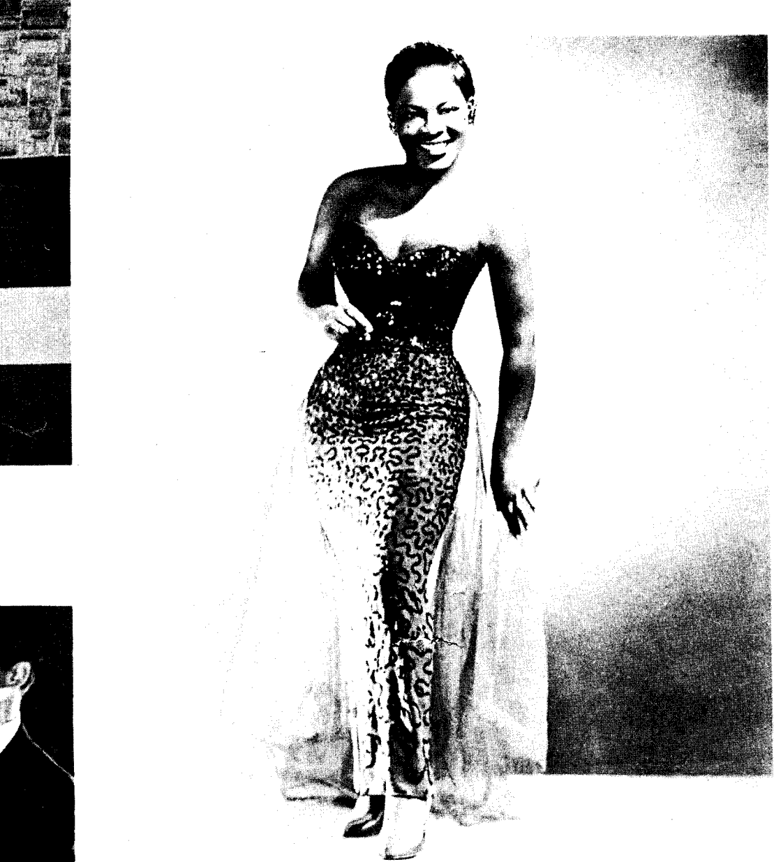
LOVELY LA VERN BAKER THE "TWEEDLE DEE" GIRL