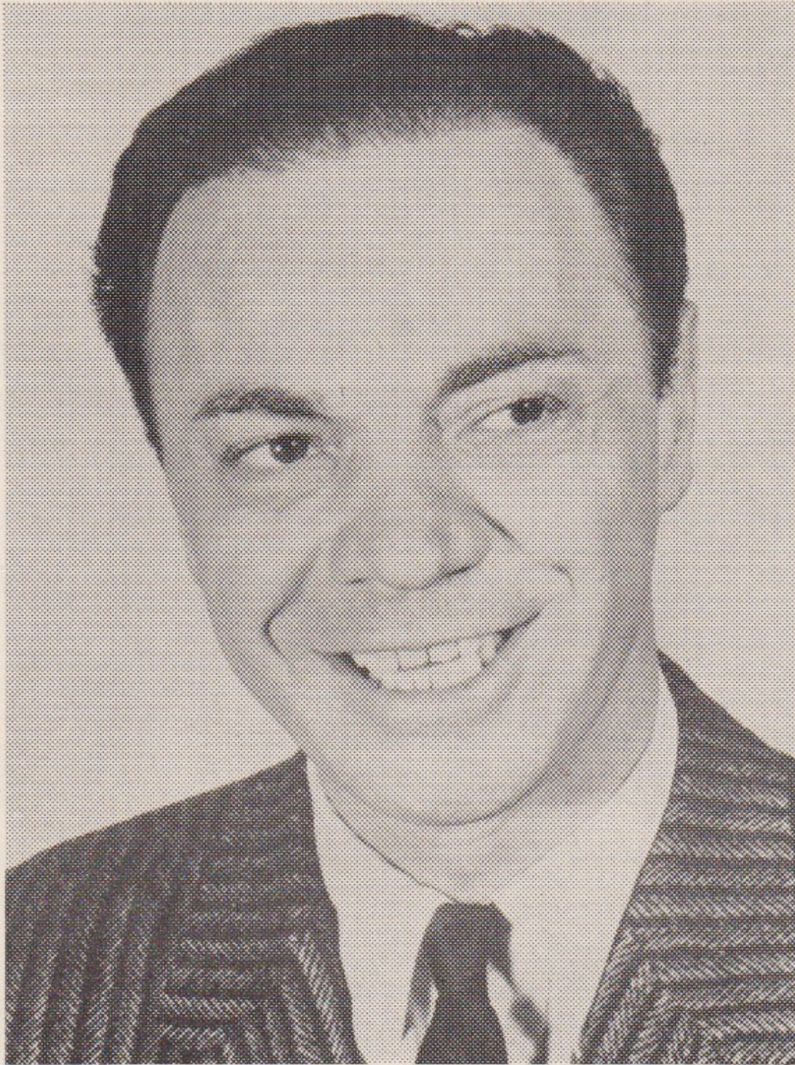
Alan Freed, the King of Rock 'n' Roll rhythm, whose "rock" platters last year broke sales records all over the civilized world. The undisputed idol of the teen-agers, Freed will head up THE ROCK 'N' ROLL REVUE — a special musical program with a cast of outstanding Rock 'n' Roll performers on Saturday, May 4 at _____ pm on Channel _____ and the ABC Television Network.