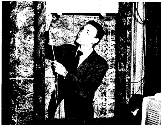
Dissolves to host, Alan Freed, who opens the ticket booth and invites the audience into the theatre.