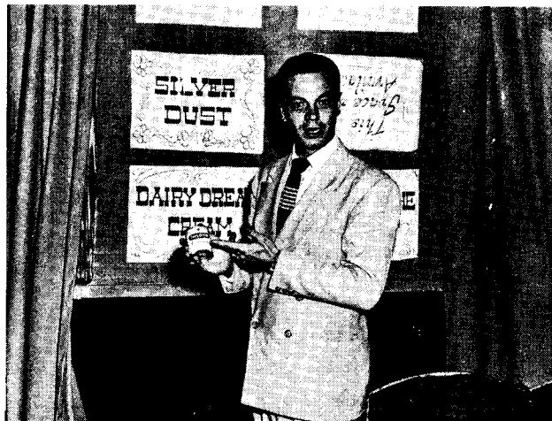
Commercials are integrated by returning to theatre set at appropriate break in film. Commercials can be film or delivered live by Freed. Participating advertisers are again identified at close of program.